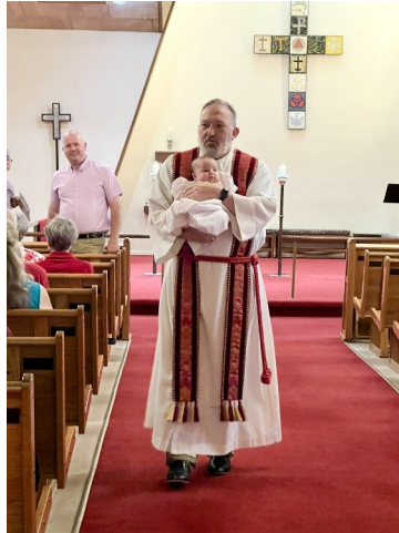
Let us welcome the newly baptized!