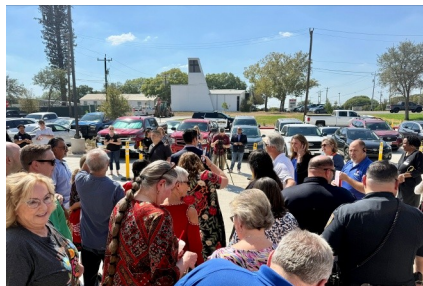
Ceremonial ribbon cutting with St. Matthew's steeple in the background.