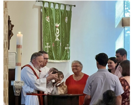
"You are sealed by the Holy Spirit in Baptism and marked as Christ's own for ever. Amen."