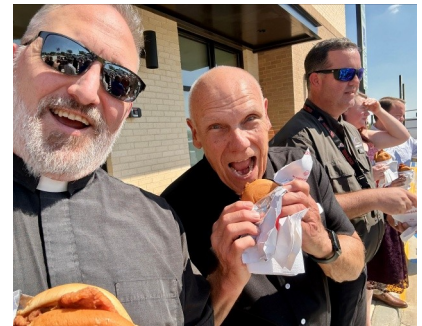
Ceremonial first bite of sandwiches!